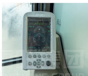
高清显示屏 HD display