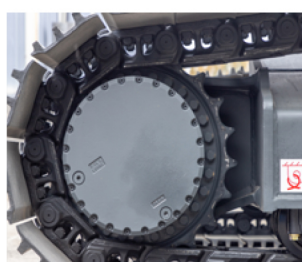
行走马达 Walking motor