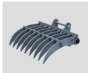
机器耙 Machine rake