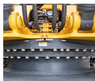
回转支承 Slewing ring