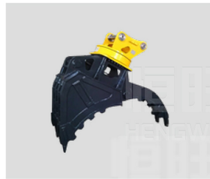
拇指夹 Thumb clip