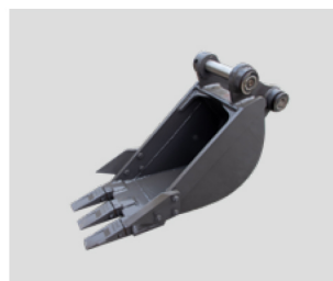
窄挖斗 Narrow bucket