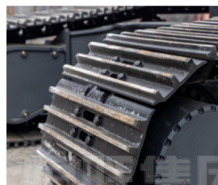
钢履带 steel tracks