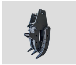
抓木器 Wood grabber