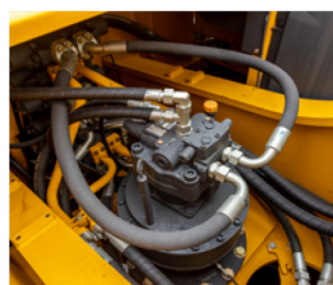
回转马达 Rotary motor