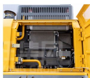
散热器 Heat sink