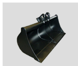
翻斗 Tipping bucket